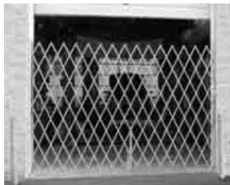
Single Folding Gates