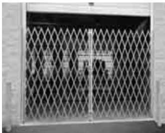
Pair Folding Gates